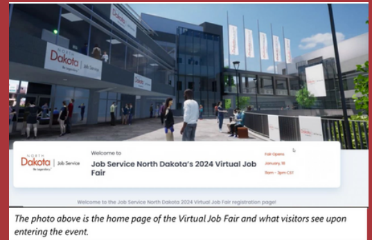
The photo above is the home page of the Virtual Job Fair and what visitors see upon entering the event.

As of January, 2024 North Dakota had a total of 14,859 job openings. Events like our Virtual Job Fairs hope to attract people to our great state and help employers fill their positions with qualified applicants.