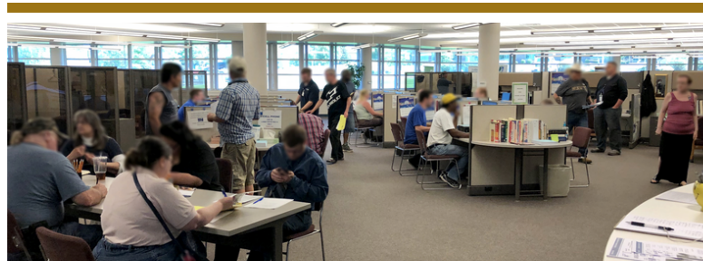
Fair Chance Job Fair at the Bismarck Workforce Center Resource Room